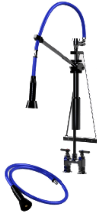
Quick Connect Coupler