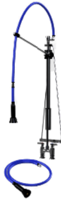
Quick Connect Coupler