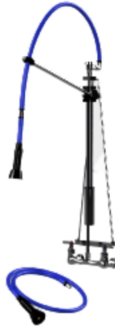
Quick Connect Coupler