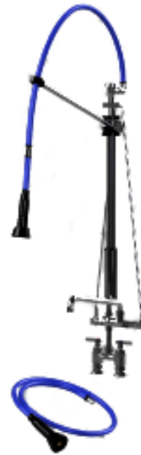
Quick Connect Coupler