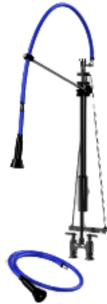
Quick Connect Coupler